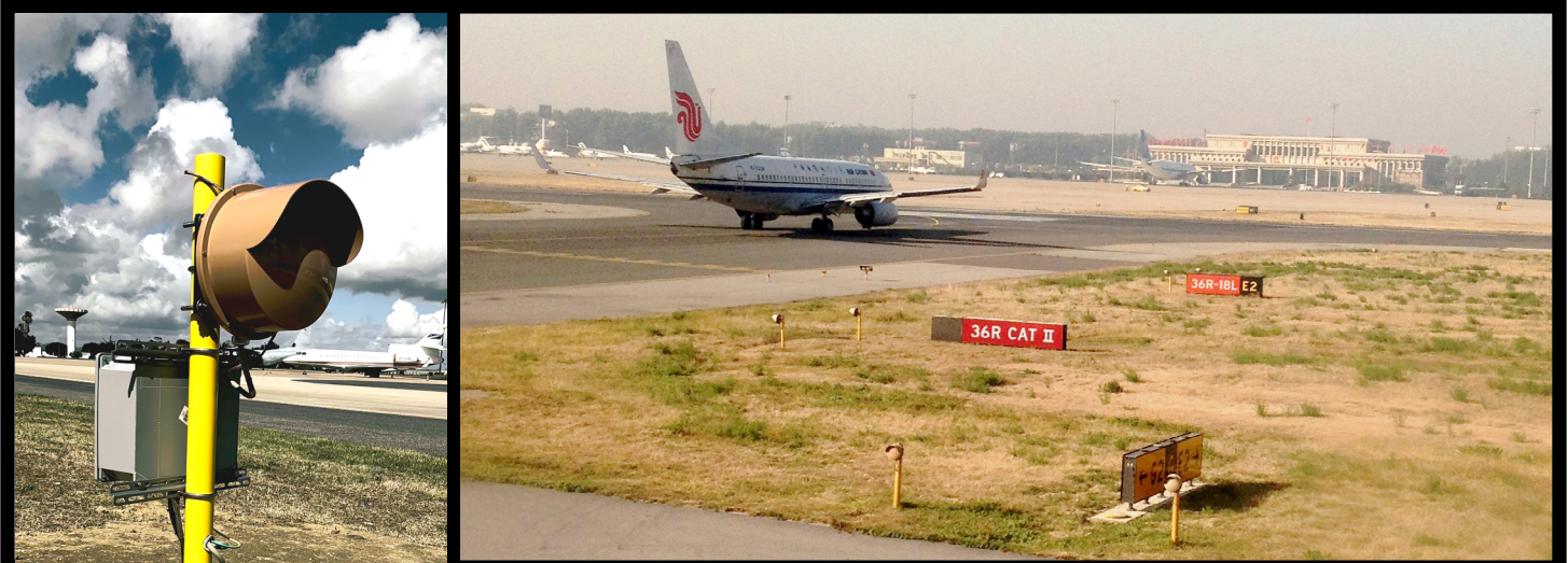
Prevent Runway Incursions By Integrating Model 316-33470 Volumetric Stop Bar Control Sensors With Stop Bar Illumination

Runway incursions are a leading security concern for airports across the world. According to the U.S. Bureau of Transportation Statistics, annual flights from U.S. airports increased from 8.8 million in 2015 to 9.2 million in 2018. Along with this airport traffic increase, the Federal Aviation Administration reported that runway incursions increased from 1,458 in 2015 to 1,832 in 2019, elevating the risk of fatal collisions.