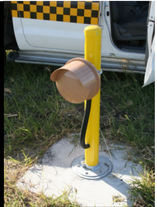
Southwest Microwave Volumetric Stop Bar Control Sensors at Sydney Airport.