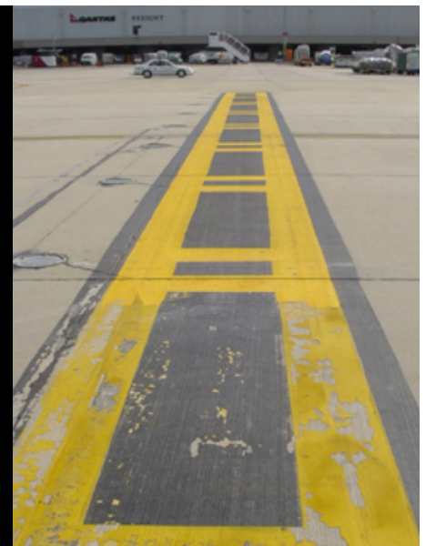
Inset Stop Bars at Runway Hold Points. Source: Sydney Airport

Stop Bar Clearance Protocol: Aircraft Not to Cross When Stop Bar Lights Are Red. Proceed Through Hold Point ONLY After Stop Bar Lights Are Extinguished, Green Lead On Lights Are Illuminated and ATC Clearance Is Issued. Source: Sydney Airport